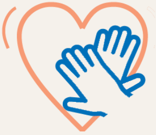
CPR / First Aid