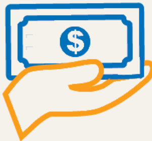
* Stipend Upon Successful Graduation