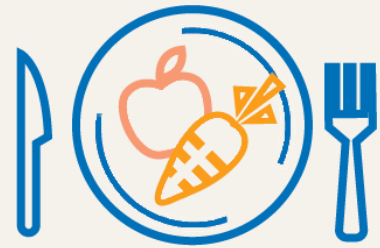
Nutrition & Diet