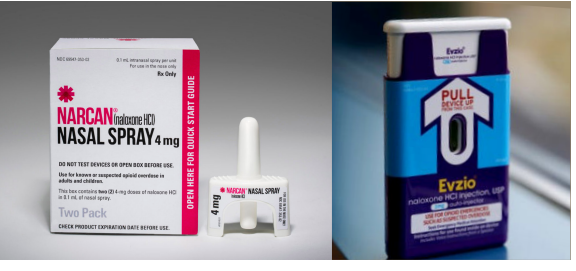
Examples of Naloxone.

Naloxone can save someone from an opioid overdose. It begins working within two (2) to three (3) minutes. The medicine comes in a spray (left picture) or injection device (right picture) that are both easy to use.