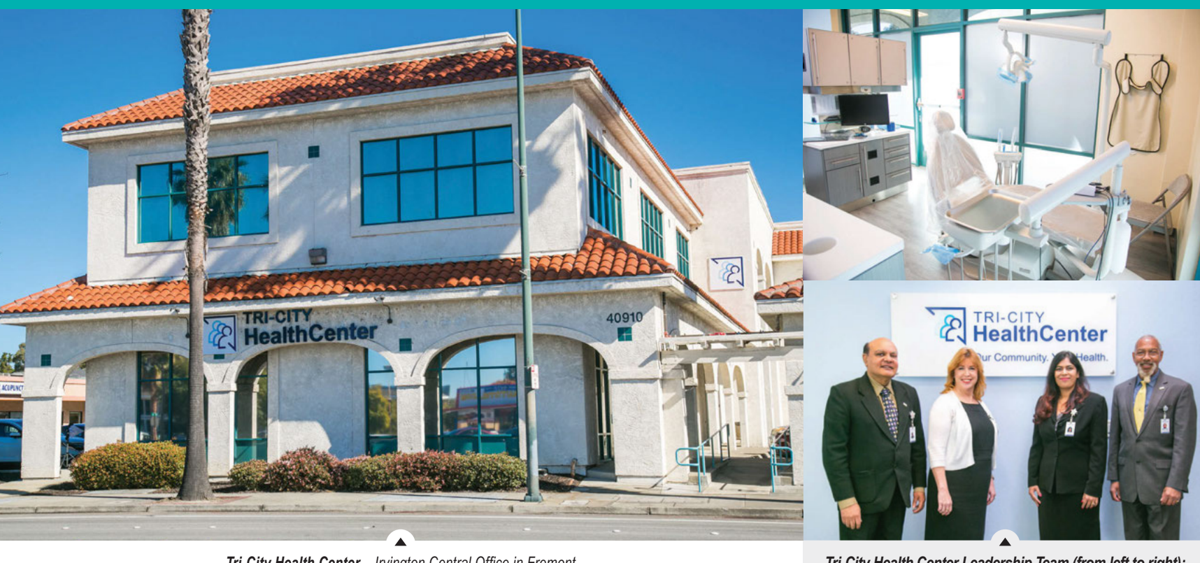
Tri-City Health Center - Irvington Central Office in Fremont

TRI-CITY HEALTH CENTER (TCHC) is dedicated to providing Alliance members in Southern Alameda County with full-service health care. They excel when it comes to having doctors and staff who share the culture and language of the patients they serve. For over 40 years, TCHC's mission has been to deliver excellent health services in a caring, nurturing, and respectful atmosphere and improve the quality of life for every individual and family in our community.